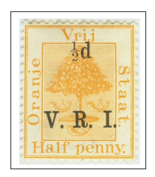
"1/2d" over "V.R.I." signed