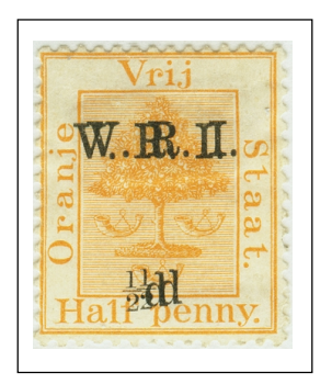
widely spaced double surcharge