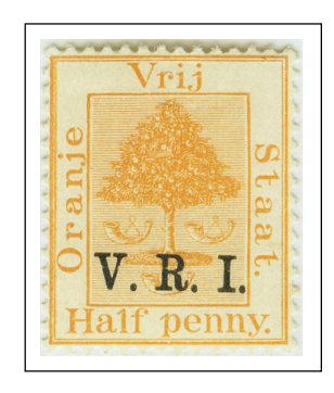
"1/2d" missing "V.R.I." at bottom