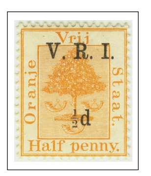
"1/2d" on 1/2 penny orange surcharge normal