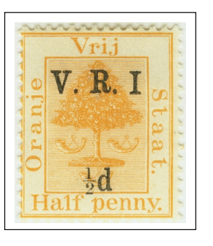
missing "." after "I"