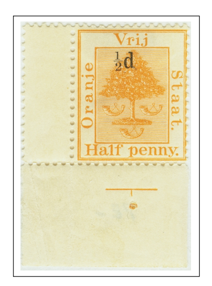
missing "V.R.I." "1/2d" transposed

upper: "1/2d" over "V.R.I." lower: missing "V.R.I."