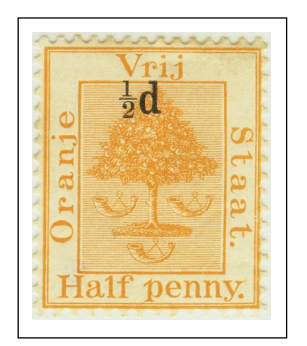
"V.R.I." missing "1/2d" at top