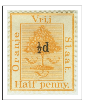
"V.R.I." missing "1/2d" at middle