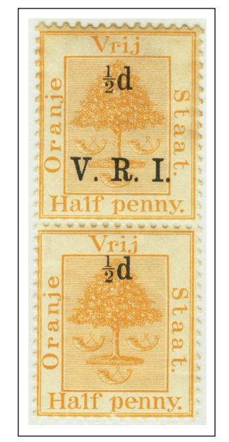
upper: "1/2d" over "V.R.I." lower: missing "V.R.I."